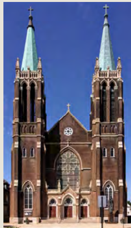
St. Mary of Czestochowa Church 3010 South 48th Ct. Cicero, IL 60804